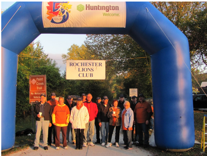
"Brooksie Way Half Marathon", Lion members and friends serving water to the runners. Estimated to be close to 6,000 participants.