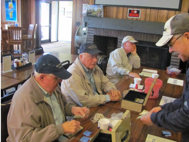
Ka-ching Ka-ching . Lions at the Golf outing day on Sept 27th. 50 Golfers attended the event .